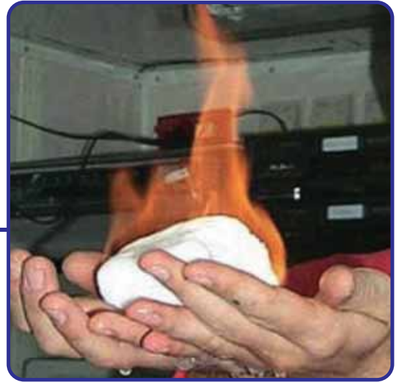
メタンハイドレート (住友商事) Methane Hydrate (Sumitomo Corp.)