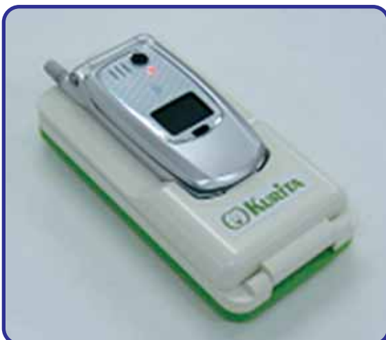
MCC を使用する液体のない携帯電話充電試作機 (栗田工業)

Prototype of New Liquid-free Battery System with MCC (Kurita Water Industries Ltd.)