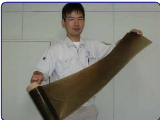
無機／有機複合電解質膜（W/PVA 膜） （ニッポン高度紙工業）

Organic/Inorganic Hybrid Electrolyte Membrane (W/PVA Membrane) (Nippon Kodoshi Corp.)