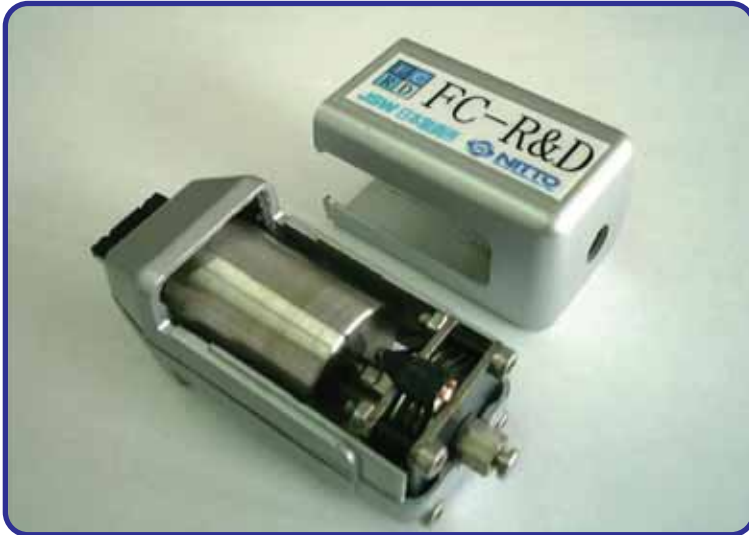
マイクロタンク・セルを応用した 携帯電話充電器 (FC-R&D)

Charger for Mobile Phone Applying Micro MH Cylinder and Micro Cell (FC-R&D Corp.)